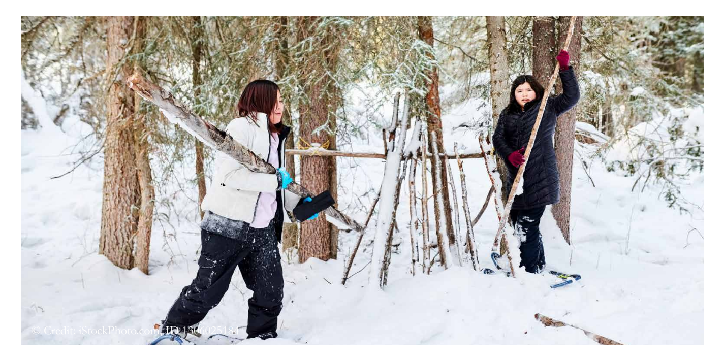
<sup>8</sup> With regard to photography, many studies (e.g., Hatala et al., 2020; McHugh et al., 2014; McHugh, Coppola, et al., 2013; Shea et al., 2011) specifically referenced Photovoice, an arts-based methodology that engages populations—often racialized and/or experiencing poverty, class-based marginalization, etc.—in video or photography to explore and share various features of their environment.

Fourth, researchers need to think more broadly about how community is defined. This requires a recognition that, firstly, communities are culturally diverse and, secondly, findings are not broadly applicable across communities, even when those communities share certain attributes (e.g., rural, northern) (Halsall & Forneris, 2016; Hudson et al., 2020; McHugh et al., 2015; Nykiforuk et al., 2020). A specific example can be found in Kosowan et al. (2019), whose study called for greater engagement with First